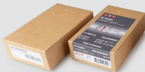
Box with 10 Coupler bags with small or large label