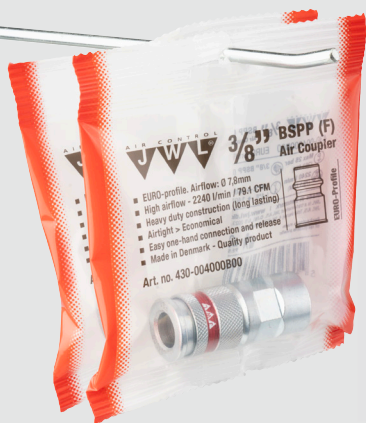
Bag with 1 Quick Coupler