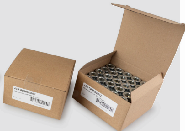
Box with 25 bulk Quick Couplers with small label